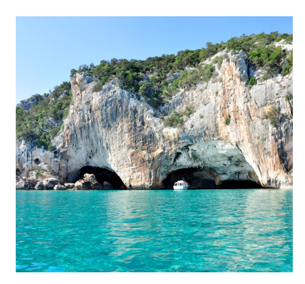
Les Calangues (Marseille) 卡朗格峽灣(馬賽)