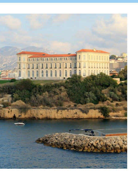
Le Palais du Pharo (Marseille) 法羅宮(馬賽)